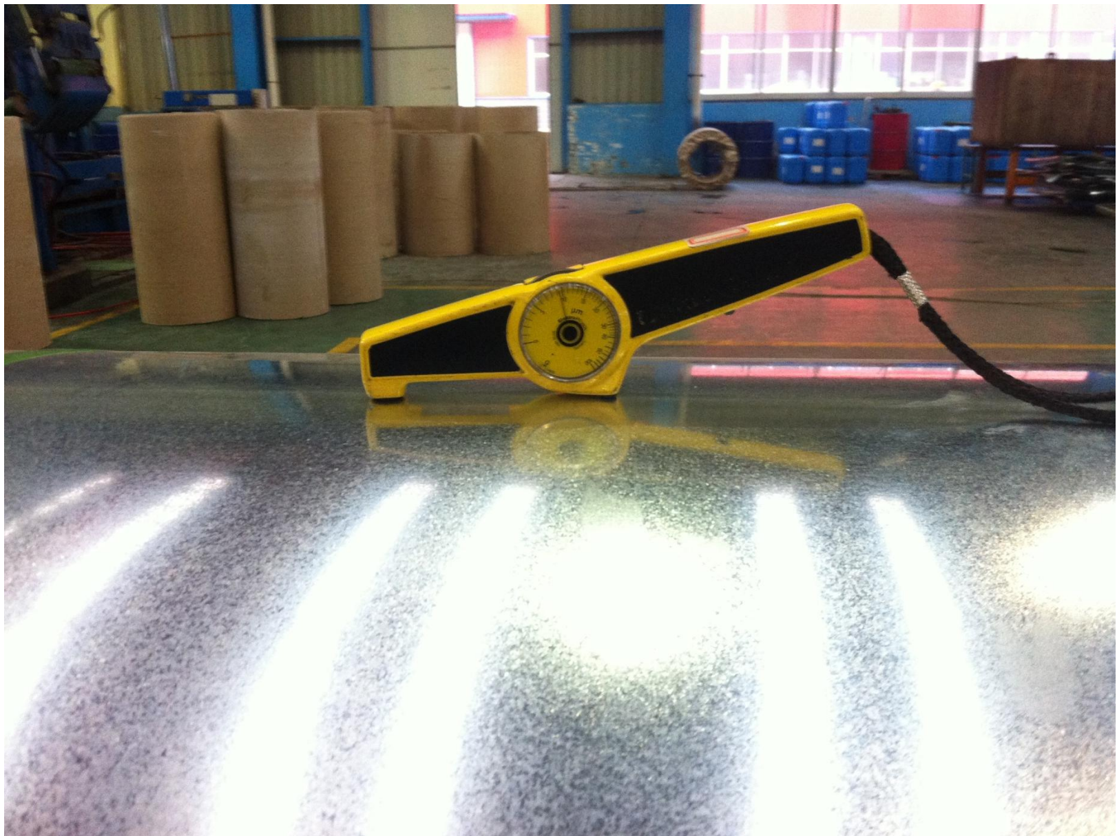
THIS IS REGULAER SPANGLE BRIGHT SURFACE