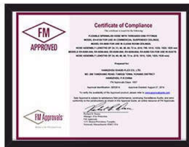
FM Approved: Flexible Joint, Expansion Joint, Flexible Sprinkler Hose