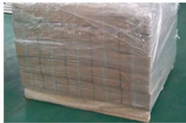
Type1: Carton Box with Pallet