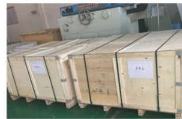
Type 2: Plywood Case