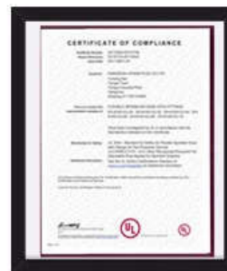
UL Listed: Flexible Sprinkler Hose