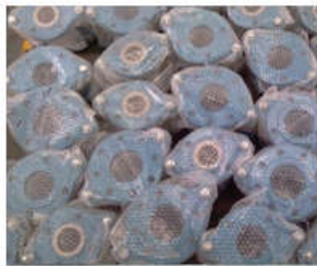
Pack Each Product Separately by Foam Sheet

No Unacceptable Packaging Material or Bamboo Products been Used as Packing