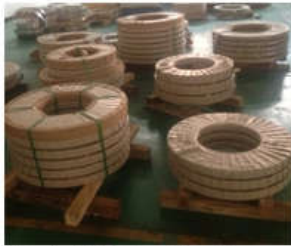
Material: Stainless Steel Tape