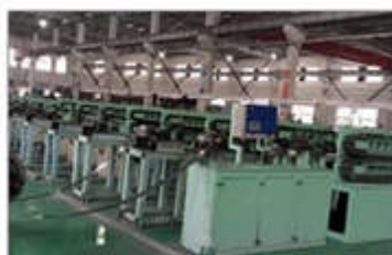
Corrugated Pipe Machine