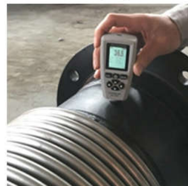
Paint Thickness Inspection