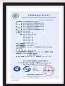
CCC Certified Flexible Sprinkler Hose