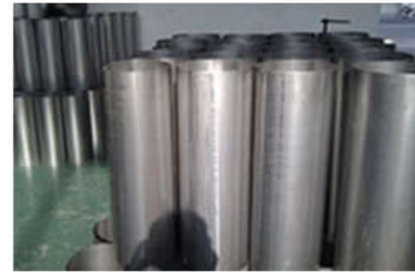
Material: Stainless Steel Tubes