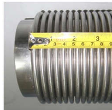
Bellows Shaping Inspection