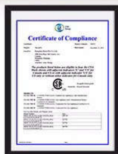
CSA Certified: Gas Connector