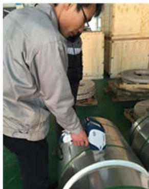
Raw Material Inspection