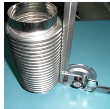
Bellows Verticality Inspection