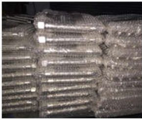
Pack by Foam Sheet