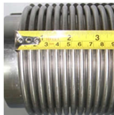
Bellows Shaping Inspection