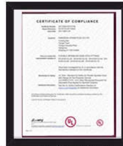
UL Listed: Flexible Sprinkler Hose