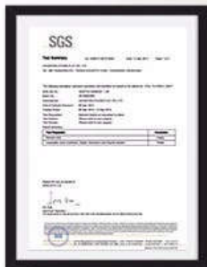
CSA Certified: Gas Connector