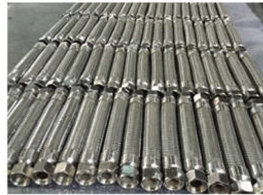
EH-504 Metal Flexible Tube