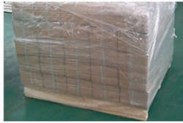
Type1: Carton Box with Pallet