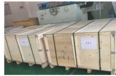
Type 2: Plywood Case