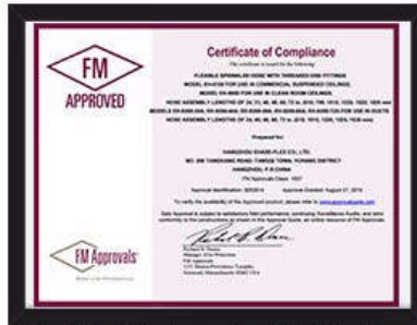
FM Approved: Flexible Joint, Expansion Joint, Flexible Sprinkler Hose