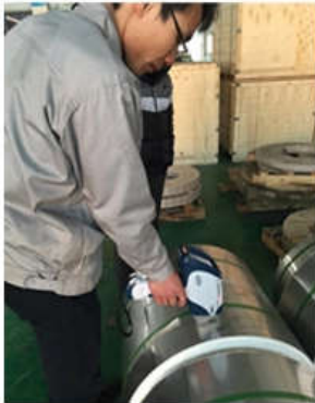
Raw Material Inspection