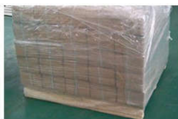
Type1: Carton Box with Pallet