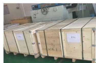
Type 2: Plywood Case