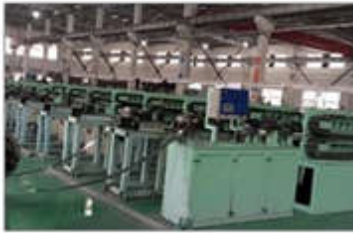
Corrugated Pipe Machine