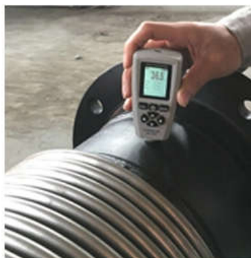
Paint Thickness Inspection