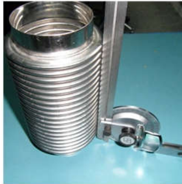
Bellows Verticality Inspection